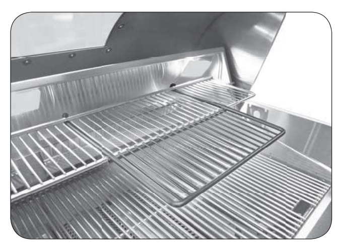
Fig. 1-2 Warming rack extender in place